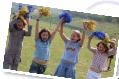
some pictures from last years tour

Please make their lives easier by making payments on time and responding to any queries promptly.